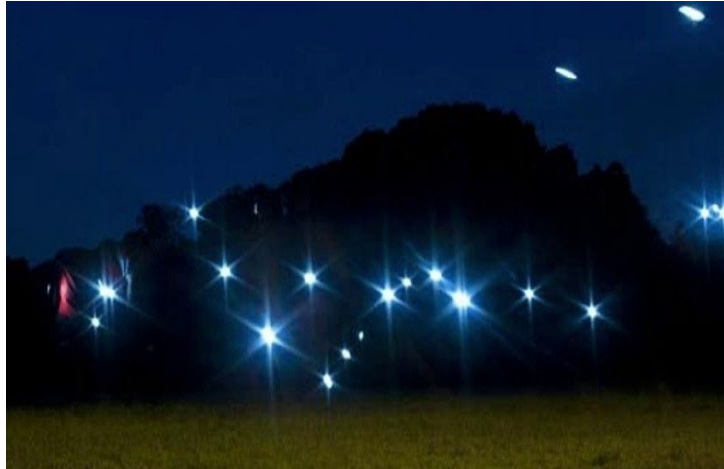
Image from Pinterest, https://bit.ly/3hlX8vd , accessed June 4th, 2021.