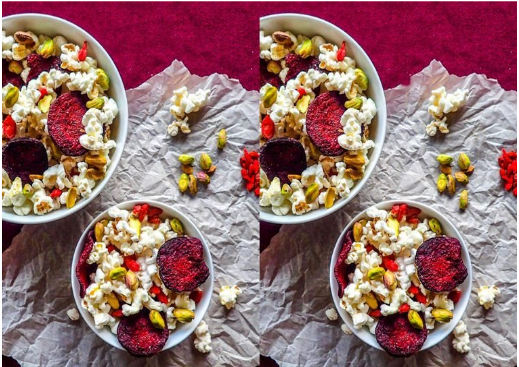
Image from Melvin Vasquez, Courtesy Maggie Moon/Mind Diet, https://bit.ly/3wa68Jd , accessed June 10th, 2021.